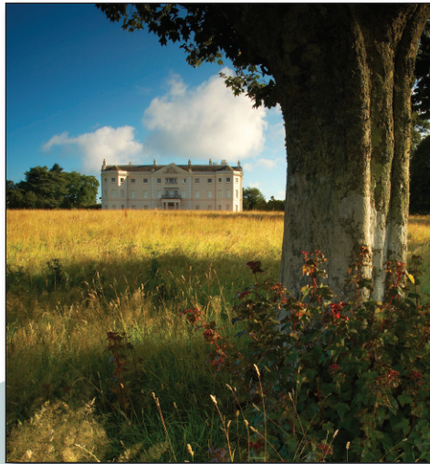
Right: Saltram House . This National Trust Georgian mansion stands in 500 acres of beautiful grounds. It was used as a location for the film 'Sense and Sensibility'.