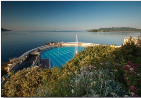
Above left: Tinside Lido . Originally opened in 1913 the public swimming bath has changed over the years. In the thirties new art deco terraces and a bathing house were added. It fell into disrepair in the eighties but was transformed and re-opened in 2003.