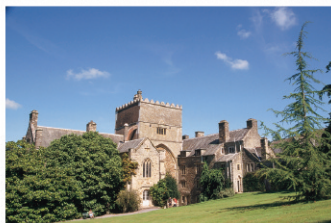
Buckland Abbey . This 700 year old building was the former home of Sir Francis Drake. Now owned by the National Trust, among its many other treasures it houses Drake's Drum.