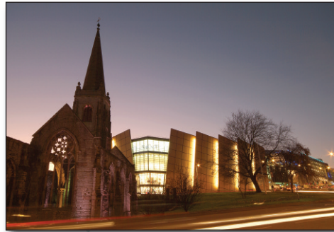
Above right: The Charles Cross roundabout has witnessed many changes over the years, and now in its modern guise it forms a spectacular gateway to the city.