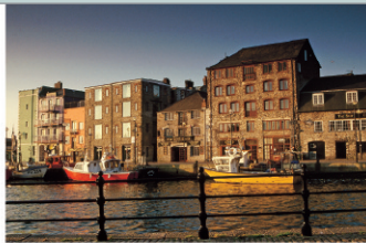
Sutton Harbour, Barbican . A picture postcard view of the historic Barbican where colourful fishing boats remind us of Plymouth's once great fishing industry.