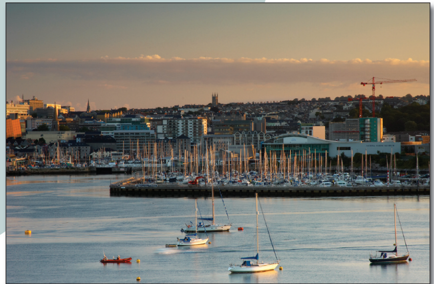
Dawn light over Sutton Marina and Plymouth city centre